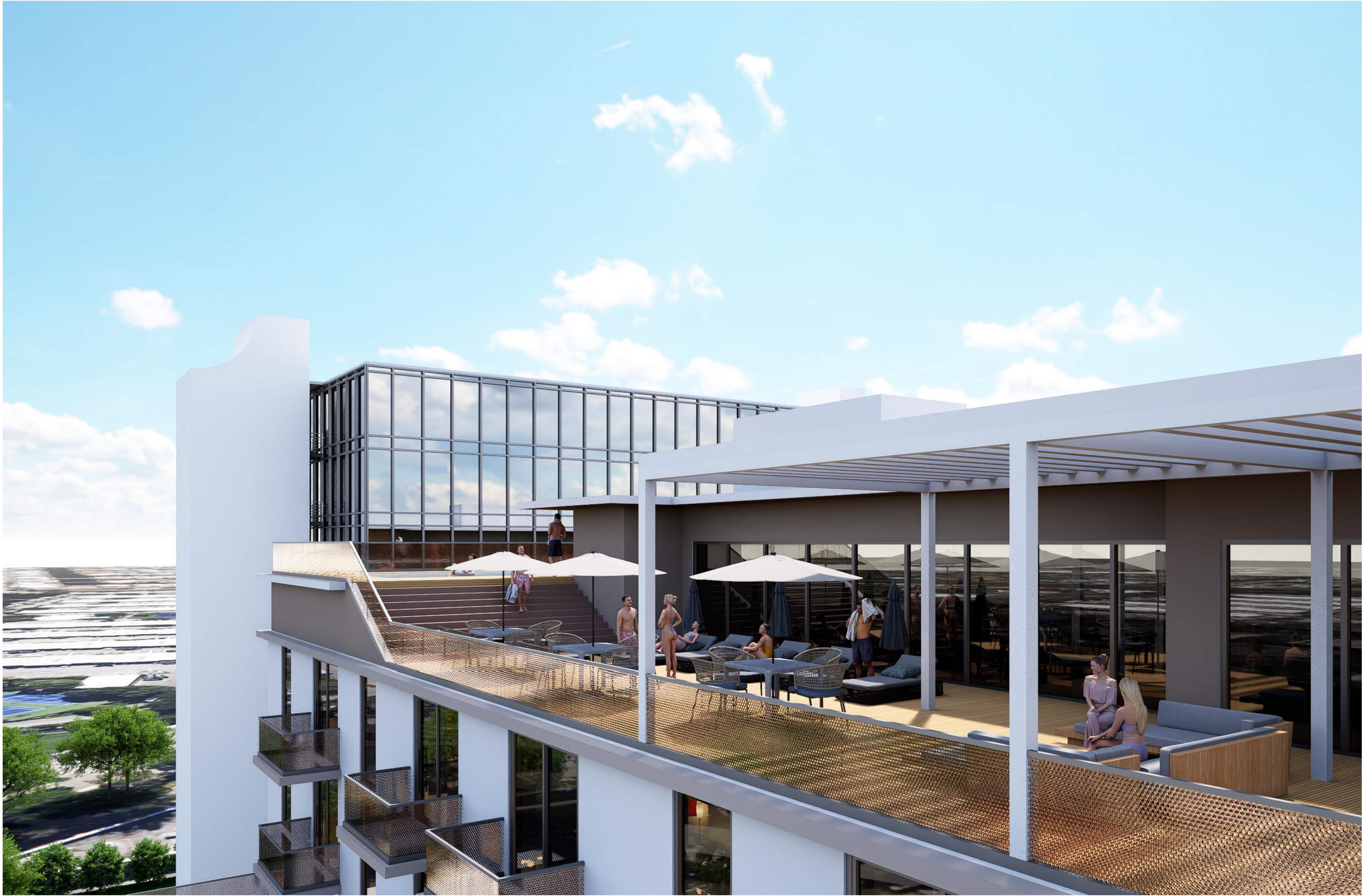
ZOOM-IN VIEW OF THE ROOFTOP TERRACE